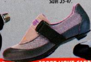
SPORT LIGHT CARBON

The pedal designed for the cycling enthusiasts.