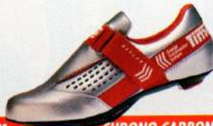
CHRONO CARBON KELVAR

Ultra light pedal specifically designed for time trial and triathlon. Titanium axle, magnesium body. Weight 168 grams.